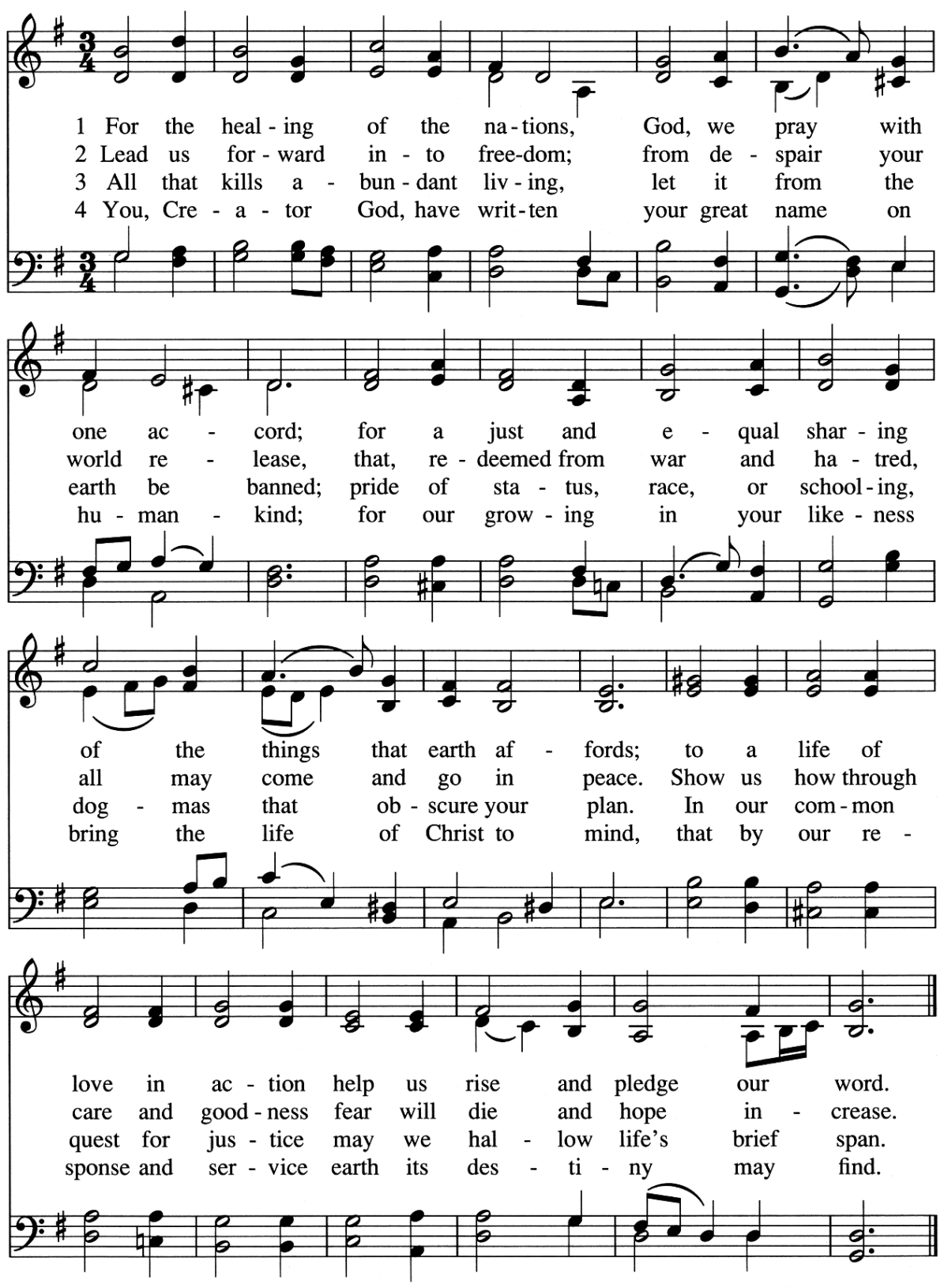
Fred Kaan's most widely published text was first sung at Pilgrim Church in Plymouth, England, at a service of worship marking Human Rights Day in 1965. It has been used for many subsequent occasions, including the twenty-fifth anniversary of the United Nations.

Tune: WESTMINSTER ABBEY 8.7.8.7.8.7. Henry Purcell, c. 1680 Arr. Ernest Hawkins, 1842